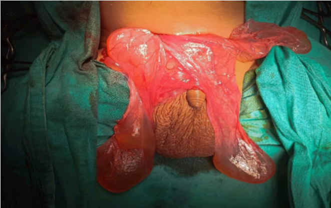
Figure 2: Omental cyst removed from bilateral inguinal sacs.