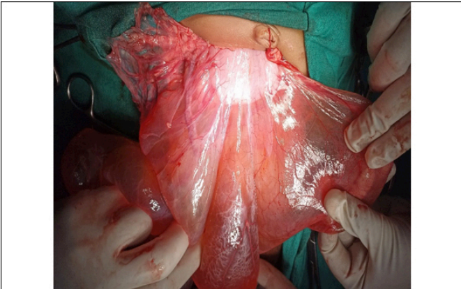
Figure 3: Huge omental cyst arising from the greater omentum.