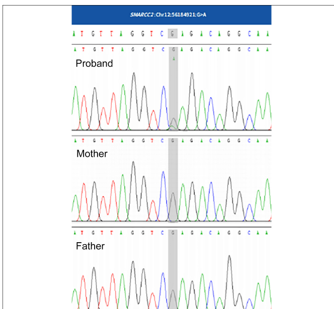
Figure 2: Sanger sequencing variation of the SMARCC2 gene mutation:

the c.415C>T (which presented another strand G>A).