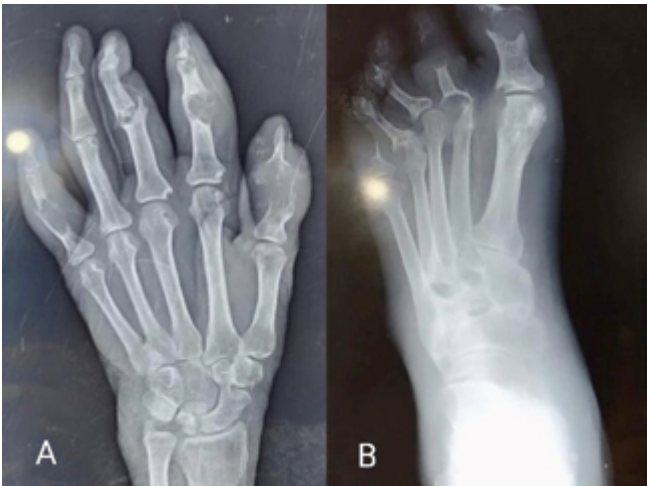
Figure 2: X-ray of hand (A) and foot (B) showing multiple subarticular expansile lytic lesions.