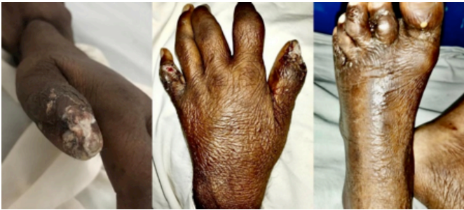
Figure 1: Multiple periarticular cystic swellings with whitish granulated discharge are seen.

Ultrasound examination of the bilateral knee joints confirmed the presence of subcutaneous heterogeneous opacities in the periarticular region, as well as joint effusion. Moreover, gram staining and culture sensitivity of joint aspirate were negative. Aspiration from the knee joint as well as tophi revealed needle-shaped monosodium urate crystals on microscopy (Figure 3), which confirmed gouty arthritis.