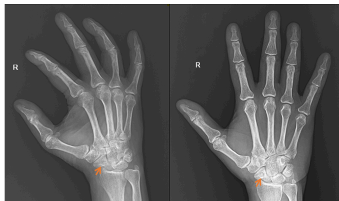
Figure 1: X-ray of the right of the hand. A small round lucent lesion with central nidus seen in the scaphoid bone (orange arrow). (a) Oblique view (b) Anteroposterior view.

On physical examination, there were no signs of swelling, erythema or tenderness at wrist joint. The x-ray of hand was done which was normal along the phalanges but there was an incidental finding of a rounded lucent area with central sclerotic dot along the anterior half of the scaphoid bone suspicious for osteoid osteoma (Figure 1). So, a CT scan of hand was done which showed features similar to x-ray with a lucent rounded area with central sclerotic dot (Figure 2). On MRI, it showed peripheral abnormal isointense area, which appeared lucent on radiograph and central low signal, which appeared sclerotic on radiograph (Figure 3). On the basis of the three imaging modalities, a diagnosis of osteoid osteoma was made.