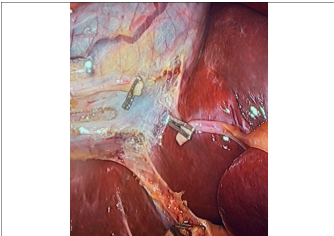
Figure 2: Intraoperative findings after ligation during the surgery.