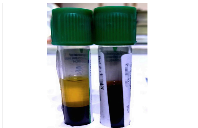
Figure 1: Normal plasma (Right tube), Dark Brown Plasma (Left tube).

Ind bilirubin, indirect bilirubin; ALT, alanine transaminase; AST, aspartate transaminase; ALP, alkaline phosphatase; GGT, gamma-glutamyl transferase; HCO 3 , bicarbonate; LDH, lactate dehydrogenase; CPK, creatinine phosphokinase.