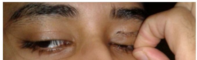
Figure 2: Pulling eyelid and eyelashes down with index finger and thumb.