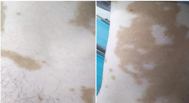
Figure 1: The before and after pictures of vitiliginous patches in Group A (combination treatment).

An excellent response was observed in 47% of the lesions treated with combined therapy, compared to 6% of the lesions treated with tacrolimus ointment 0.1% alone. Of the lesions in Group A and B, good response was observed in 30% and 46.7%, respectively. There was a significant difference between the two Groups. The combined treatment required fewer total sittings for response than tacrolimus ointment 0.1% alone. A marginal type repigmentation pattern, which accounted for 80% of Group A and 66.7% of Group B, predominated in both Groups. A perifollicular pattern was present in 20% of Group A and 16.7% of Group B. After just one session, repigmentation began as erythema and pigments. With combination therapy, an excellent response was seen in four weeks, compared to six weeks with tacrolimus ointment 0.1% alone as shown in Table II. The before and after photos of the vitiliginous patches in Group A (combination therapy) are displayed in Figure 1, while Figure 2 displays the vitiliginous patches in Group B (tacrolimus ointment alone) before and after photos.