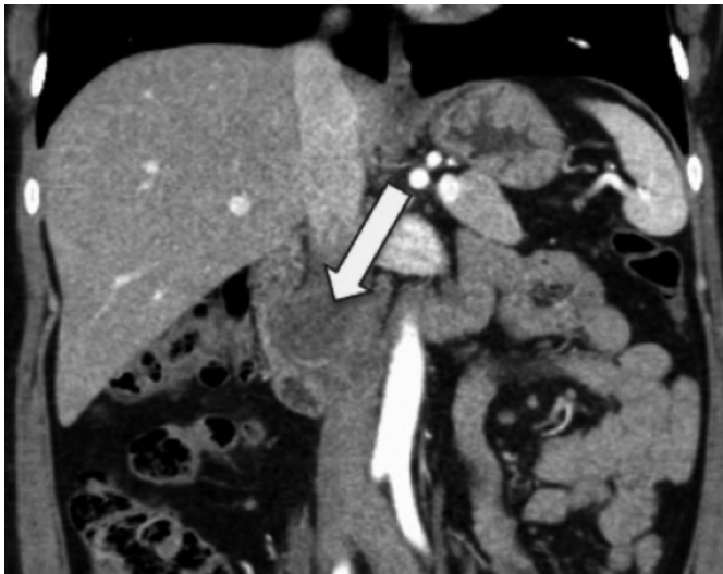
Figure 1: Computed tomography scan, sagittal cut, revealing a leiomyosarcoma of the inferior vena cava: expansive lesion in the infra-renal inferior vena cava, hypodense and heterogeneous, with endoluminal and also exophytic growth, measuring approximately 3.9 x 2.4 x 3.4 cm (TxAPxL).

and hypovascular, and measured around 28 mm, suggestive of metastasis; the other nodule was also located in segment II and was suggestive of focal nodular hyperplasia.