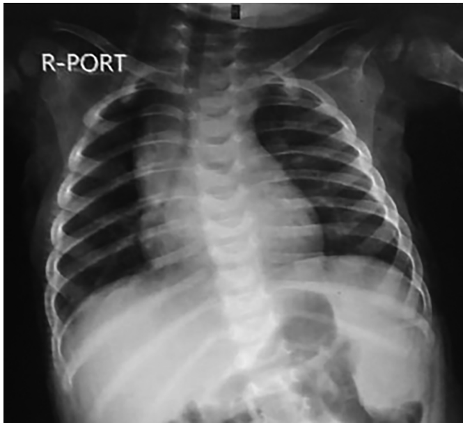
Figure 1: Chest x-ray showing mediastinal widening.

ment was done and the patient was kept on the list for the insertion of port-a-cath but the family left against the medical advice (LAMA) on the next day of admission for spiritual/alternative medicine and came back after three weeks with a deteriorated clinical condition, hyperleukocytosis (TLC: 436 \times 10^9/l with 94% blasts) and findings of tumor lysis syndrome. The patient collapsed within a few hours of presentation and could not be revived.