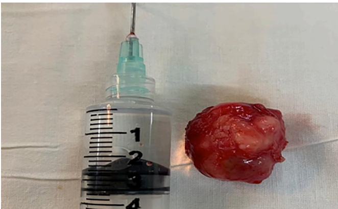
Figure 2: Gross appearance of the excised mass showing single tan-pink nodular tissue piece measuring 2.5×1.7×1.5 cm in size.