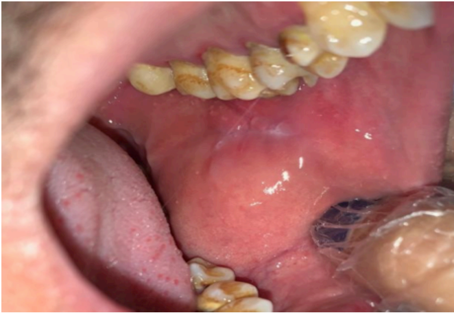
Figure 1: The intra-oral appearance of swelling with the same color as that of surrounding buccal mucosa.