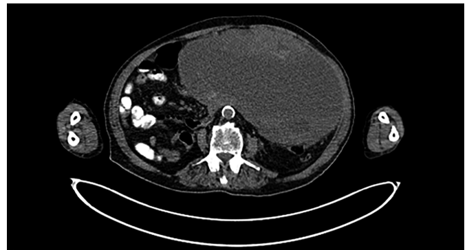
Figure 1: CT abdomen. A well circumscribed predominantly cystic lesion is seen arising from the posterior wall of the stomach. It measures approximately 12.9 × 16.4 × 18.2 cm in AP, TS, and CC dimensions. On post-contrast images, it shows peripheral enhancement with enhancing solid component and mural nodules attached to the wall of cystic lesion.

In two months, he presented to the hospital with progressive abdominal distention and had undergone ultrasound-guided fluid drainage from cystic mass more than 10 times with quantity of fluid ranging from 450 to 2700 ml per shift. During this period, he was commenced on Imatinib, 400 mg, once daily. The frequency and amount of cyst fluid drainage declined steadily while on imatinib therapy. However, after 2 months of therapy, the disease started progressing and repeat imaging revealed a well-defined heterogeneous mass with predominantly cystic component giving no definite internal vascularity on colour Doppler imaging, mostly in the left hypochondrium and now measuring 21.2 × 19.4 × 21.8 cm (Figure 2). He was switched to Sorafenib, 200 mg once daily, due to disease progression and further decline in his overall general condition. Four months after the initiation of Sorafenib, the gastric mass showed a clinical response, and the drug was well tolerated without any adverse effects. However, during the fifth month, the patient died due to aspiration pneumonia.