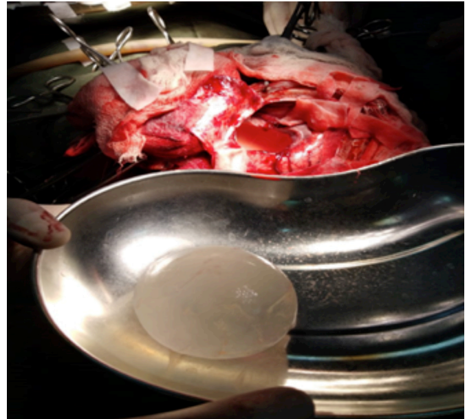
Figure 2: Intact hydatid cyst removed by hydro-dissection.

Our patient was a 10-year shepherd by occupation, belonging to a cattle farming area. Hydatid disease is reported from all over the world but the main foci are sheep and goat farming areas of the subcontinent, Mediterranean regions, Australia, America and Africa. According to literature, this disease is more common in the pediatric age group in endemic areas, especially in those having contact with sheep and goats. 1