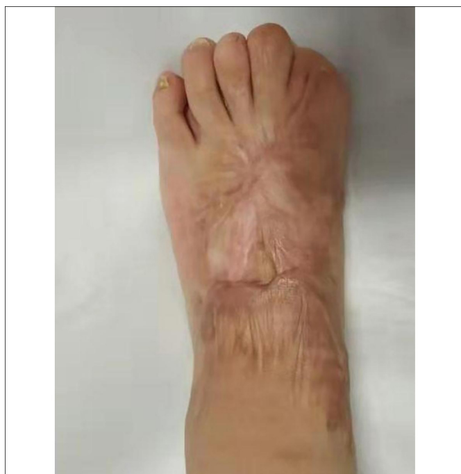
Figure 2: Follow-up at 110 days after the injury. The wound of the dorsum and toes 1-3 were healed, with partial scarring.

matic treatment, and her vital signs were stable. In-situ skin regeneration, moist exposed burn ointment (MEBO), wound, and ulcer dressing were planned. The skin on the dorsum of the left foot had high tension and obvious ecchymosis. A small incision was made to reduce the tension, and a rubber strip was placed for drainage. When the dressing was changed three days later, the wound, drainage exudate, and secretions were cleaned with normal saline. The dressing was changed once each day. Twelve days later, the necrotic areas of the skin of the dorsum and sole were limited, and the necrotic tissue surrounding the drainage port was reduced. Twenty-three days later, the black skin scabs gradually fell off, and fresh granulation tissue formed under the wound. By days 52 to 58, wounds on the dorsum and sole were completely epidermised. The distal phalanges of toes 1-3 of the left foot were absent, and the wounds on the stumps were healed. The child had a normal arch, a normal forefoot width, good limb movement, and no obvious contractural sequelae (Figure 2).