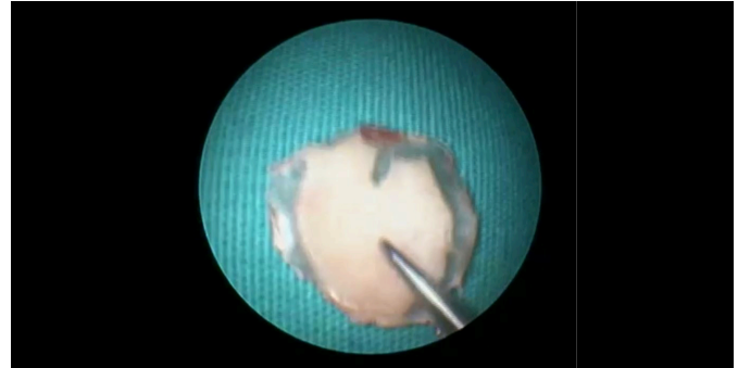
Figure 2: The notch composed on the graft and the final form of the graft.