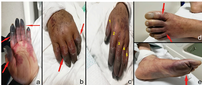
Figure 2: (a) Necrotic areas and demarcation lines in the distal metacarpals on the left-hand palmar side (red arrows). (b) Necrotic areas and demarcation lines in the distal metacarpals on the right-hand dorsal side (red arrows). (c) Numbering of fingers and view of the left hand from the dorsal side. (d,e) Starting points of ecchymosis on the feet from the dorsal and palmar side (red arrows).

The patient continued to receive (iv) hydration (1500 cc isotonic saline and 1500 cc buffered 5% dextrose). After the growth of proteus mirabilis in the culture, antibiotic was changed to meropenem, 3×1 g. On the third post-operative day, bruises and color changes were noted on the patient's hands and feet, and consultation was requested from the cardiovascular surgery with a preliminary diagnosis of embolism. Cardiovascular surgery recommended heparinisation and follow-up of the patient because the patient's pulses were full and his extremities were hot; Clexane 0.4 cc (Enoxaparine sodium, anti-Xa /0.4 ml) was started subcutaneous. On 5 th postoperative day, ischemia became prominent in the distal phalanges of fingers and toes and turned into necrosis (Figure 2). On reassessment of the patient, on doppler ultrasound requested by cardiovascular surgery, blood flow was not observed in multiple fingers and toes of both hands and feet (Figure 2) and cardiovascular surgery suggested amputation of necrotic finger and toe tips. The patient was referred to orthopaedic clinic for digital amputation. Necrotic ends of all digits were amputated. On 5 th postoperative day, efflux ion started from the stumps of the patient's