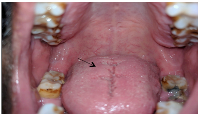
Figure 3: Postoperative view at the 6 months follow-up visit.