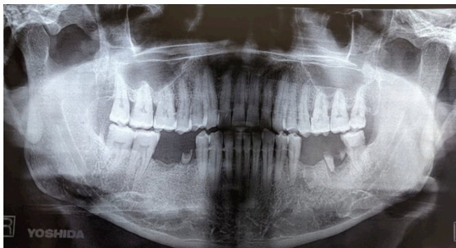
Figure 2: Crescent-shaped radiolucency along right retromolar trigone.

The histopathological examination of the lesion revealed irregular anastomosing trabeculae of the mature lamellar bone containing osteocytes and abundant marrow spaces. Fibrocellular stroma with dilated vascular channels was also seen thus, confirming diagnosis of the osteoid osteoma (Figure 4).