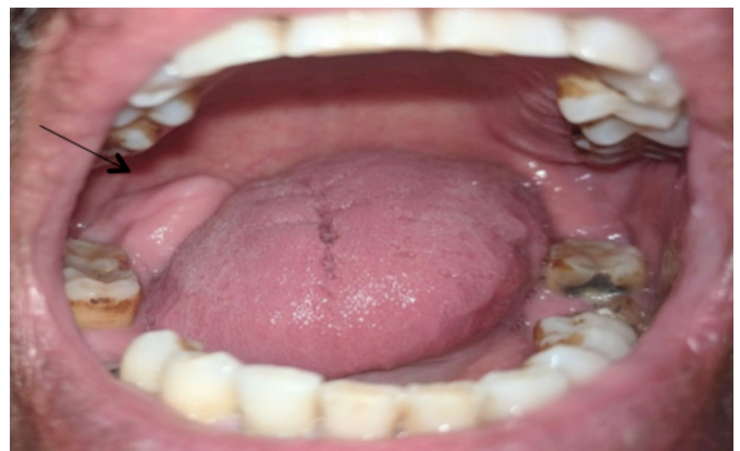
Figure 1: Clinical presentation of the lesion.

A 50-year male patient presented in the Oral and Maxillofacial Surgery Department with the complaint of swelling and pain at the right posterior side of the lower jaw for 2 years. The patient also had a complaint of interference in mastication because of swelling. Swelling had gradually increased in size and not regressed since. Pain was mild, intermittent, localised, more aggravated at night and on mastication, and relieved by taking ibuprofen. The medical and family history was non-contributory.