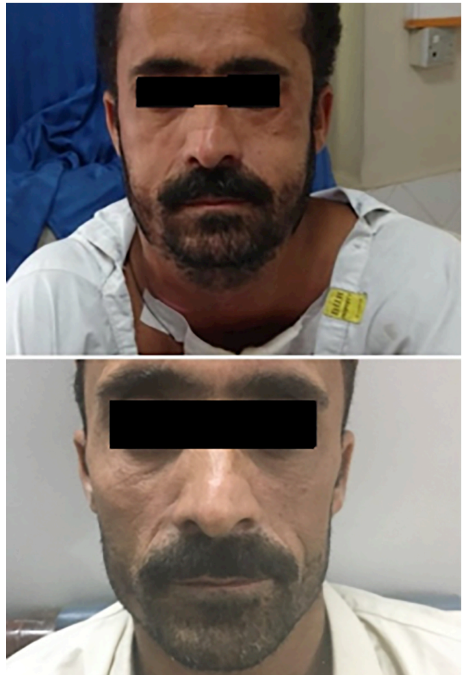
Figure 2: Patient's condition A) Before the intervention, and, B) After resolution of subcutaneous emphysema.

Since the patient developed dyspnea, flexible tracheobronchoscopy was done which showed a fibrotic patch just below the cricoid but no frank tear up to the carina. Therefore, the airway was not intervened surgically allowing the defect to heal gradually. However, small sub-platysmal incisions were made in supraclavicular areas to facilitate the spontaneous expulsion of air from subcutaneous tissues. Emphysema slowly reduced and completely disappeared on the 5 th post-procedure day. Hence, the patient was discharged and kept on follow-up. On 1 month follow-up, the patient had fully recovered (Figure 2).