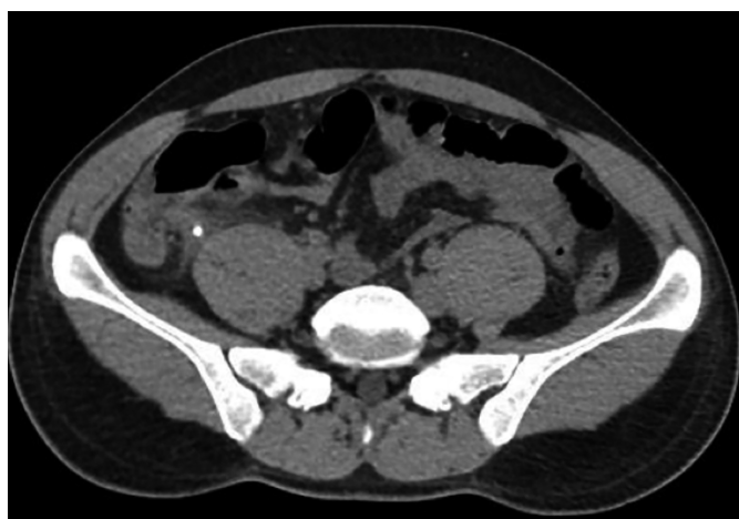
Figure 1: Axial view of computed tomography abdomen showing appendicolith (black arrow).