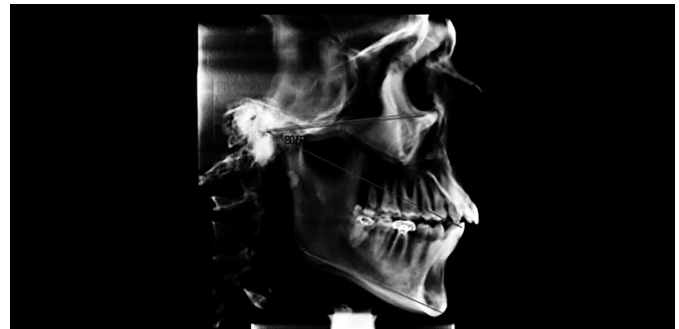
Figure 1: Lateral Cephalogram reconstructed from CBCT.

and right roots in the tooth. The statistical analysis was carried out using SPSS version 26.0. For average tooth scores and patient scores, the data were described as mean, median, mode, and standard deviation. Using the Shapiro-Wilk test, the data's normality was examined. Non-parametric tests were done since the data were not normally distributed. Comparison of right and left sides was done using Wilcoxon signed rank test. Mann Whitney U test was used to examine differences depending on gender. Spearman's rho correlation and Kruskal Wallis test were used to compare tooth and patient scores with the age of patients. The average tooth and patient scores were compared with facial biotypes using the Kruskal Wallis test with pairwise comparison. The level of significance was set at 5% or 0.05.