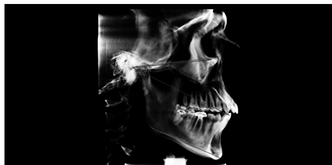
Figure 1: Lateral Cephalogram reconstructed from CBCT.

and right roots in the tooth. The statistical analysis was carried out using SPSS version 26.0. For average tooth scores and patient scores, the data were described as mean, median, mode, and standard deviation. Using the Shapiro-Wilk test, the data's normality was examined. Non-parametric tests were done since the data were not normally distributed. Comparison of right and left sides was done using Wilcoxon signed rank test. Mann Whitney U test was used to examine differences depending on gender. Spearman's rho correlation and Kruskal Wallis test were used to compare tooth and patient scores with the age of patients. The average tooth and patient scores were compared with facial biotypes using the Kruskal Wallis test with pairwise comparison. The level of significance was set at 5% or 0.05.