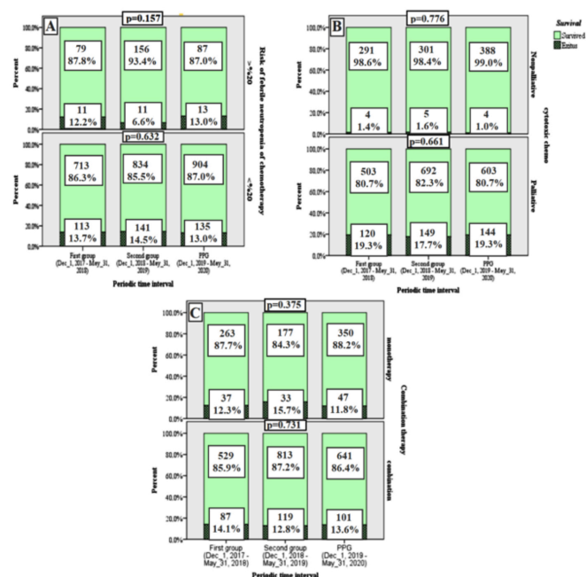
Figure 3: Mortality results according to chemotherapy options. Comparison according to the risk of febrile neutropenia (A), whether it is given for palliative purposes (B) and whether it is applied in combination (C). PPG = Pandemic period group.