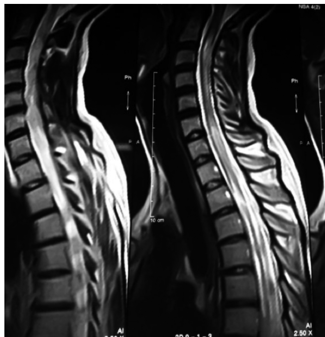
Figure 1: MRI cervical and dorsal spine, T2-weighted sagittal images showing cord swelling with longitudinally extensive lesion from C2 to T10.

improved MRS score of 3 and was discharged on oral prednisolone of 60 mg daily and azathioprine 150 mg per day.