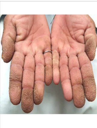
Figure 4: Tripe palms.

and blood sugar were all normal. His ultrasound (USG) abdomen showed well defined echogenic focus measuring 1.7 x 1.3 cm in proximal common bile duct (CBD), suggestive of stones. ERCP showed multiple filling defects in CBD, suggestive of stones. Multiple attempts at stone extraction were unsuccessful and a straight plastic stent was placed in CBD with free bile flow. Contrast Enhanced CT (CECT) abdomen showed ill-defined eccentric mass lesion at the confluence of right and left hepatic ducts measuring approximately 2.9 x 3.2 x 2.7 cm in size, with resultant upstream dilatation of intrahepatic biliary channels. CECT chest showed no evidence of metastatic disease in either lung. MR cholangio-pancreatography showed distended CBD measuring 15 mm, with multiple signal voids suggestive of calculi and sludge balls. However, proximally close to the confluence, there was another signal void which showed internal vascularity on complementary doppler ultrasound, suggesting a mass like intraluminal Klatskin tumor rather than a sludge ball. Ultrasound-guided biopsy of the hepatic ductal mass was done and histopathology showed an undifferentiated malignant neoplasm. An extensive panel of immunostains like, Pan-CK, CK-7, CK-19, Hep Par-1, CD-34, CD-31, leucocyte common antigen (LCA), S-100, prostate specific antigen