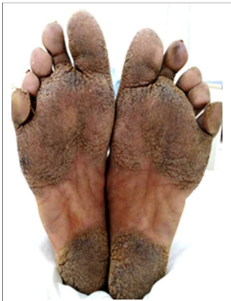
Figure 3: Hyperkeratotic plaque on soles.