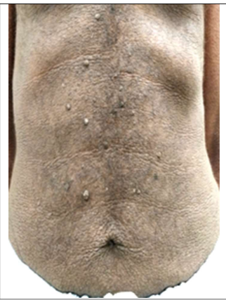
Figure 2: Velvety hyperpigmentation with florid cutaneous papillomatosis.