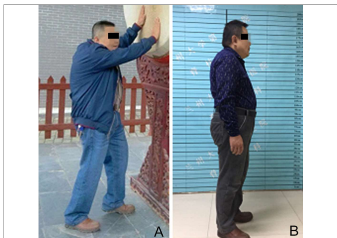
Figure 1: (A) Preoperative. (B) Postoperative.

segments. The kyphosis was oriented to the desired position (the CBVA was approximately 0°) and the nut was tightened. After waking, the patient exhibited good lower limb function.