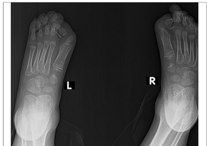
Figure 2: X-ray AP view of feet showing bilateral hallux valgus.