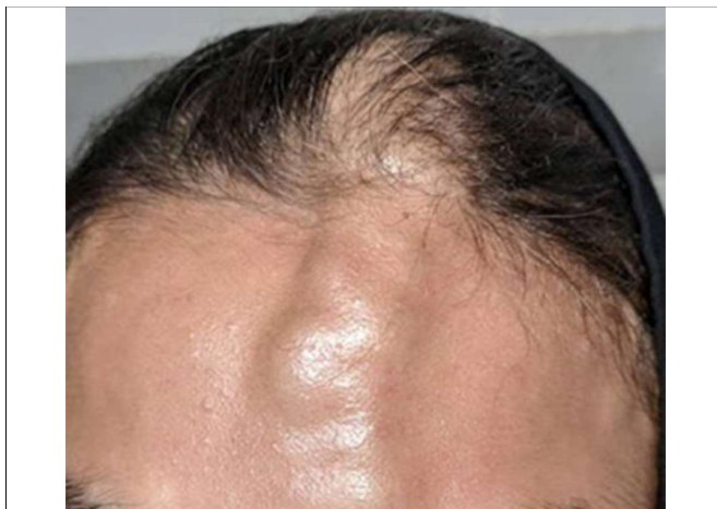
Figure 1: Serpentine swelling noted from vertex to glabella with decreased hair growth in the area.