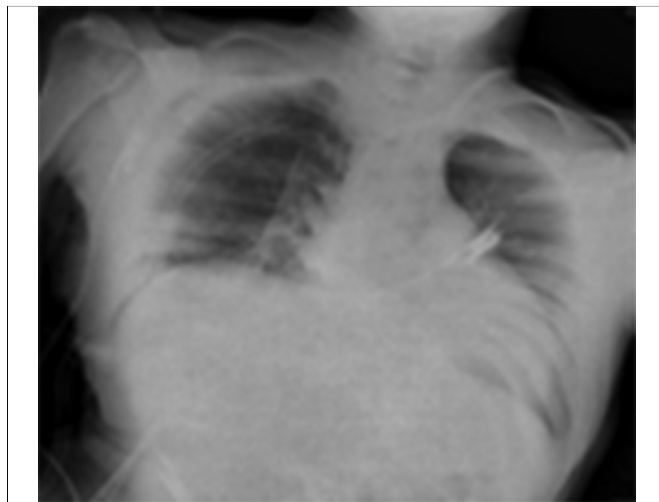
Figure 2: Postoperative X-ray graphy.

It is important to remember that hydatid cyst is able to infest all the parts of the body, and it is widespread in our country. If hydatid cyst disease is suspected, adequate clinical information should be given to the radiology unit and it should be considered in the differential diagnosis.