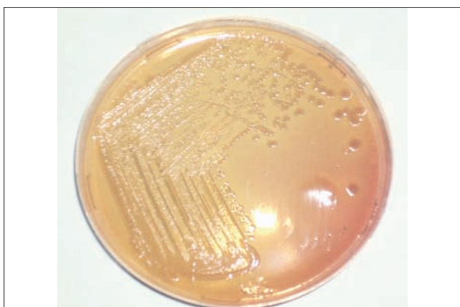
Figure 2: Non-lactose fermenting colonies on MacConkey agar.