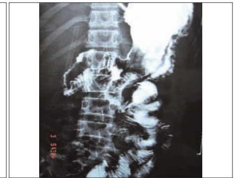
Figure 3: Postoperative barium X-rays showing free passage of the contrast into the jejunum after Strong's operation.

Anatomically, the superior mesenteric artery arises from ventral aspect of the abdominal aorta at an angle of 45°. 1-3 This aortomesenteric angle contains left renal vein, uncinate process of the pancreas and third part of the duodenum. The duodenum is held in that angle by the ligament of Trietz and is cushioned by the retroperitoneal fat and lymphatics. Any condition that causes narrowing of the aortomesenteric angle by depleting of the retroperitoneal fat may precipitate the vascular duodenal compression. Some well-known predisposing conditions include anorexia nervosa, malabsorption syndrome, drug-addiction, AIDS, malignant cachexia, and hypercatabolic states like polytrauma, major surgery, extensive burn, and invasive sepsis. 4-6