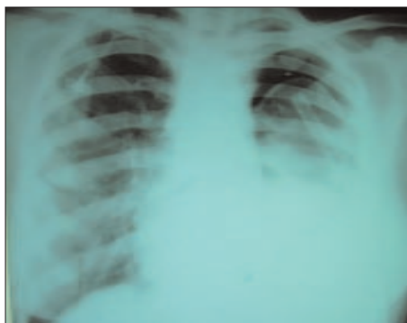
Figure 1: X-ray at presentation showing loculated fluid in left hemithorax with chest tube in position.