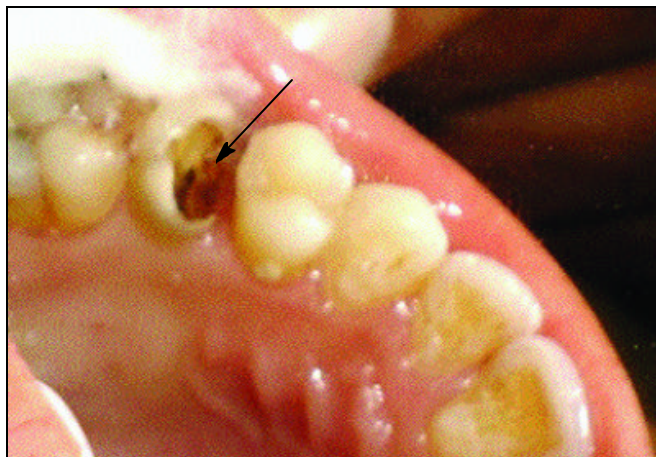
Figure 1: Clinical findings after opening the chamber (arrow showing canal orifice).