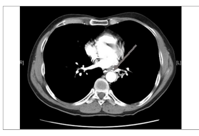
Figure 2: CT scan chest, enhanced with I.V and oral contrast showing fistula formation between the esophagus and the left lower lobe bronchus.