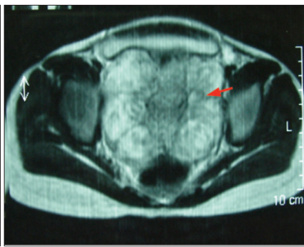
Figure 2: Heterogeneously hyperintense lobulated mass involving uterus with areas of target like appearance (central low signal intensity and peripheral high signal intensity-typical of neurofibroma) [arrow].