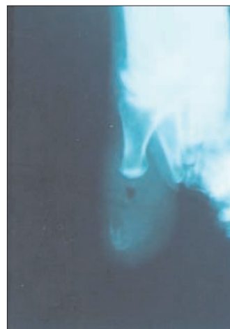
Figure 1: Radiograph of the foot demonstrates the complete destruction of the distal phalanx of great toe

Received August 18, 2009; accepted May 25, 2010.